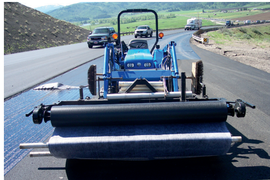
GlasPave is easy to install using conventional equipment.

With roll lengths ranging from 75 yds to 120 yds, GlasPave Paving Mats install light side down on a level up course with fewer roll changes when compared with bulkier products with shorter roll lengths. GlasPave Paving Mats are also available in two roll widths (6.25 and 12.50 ft), which make for easier placement around corners and curves, while maximizing layout efficiency.