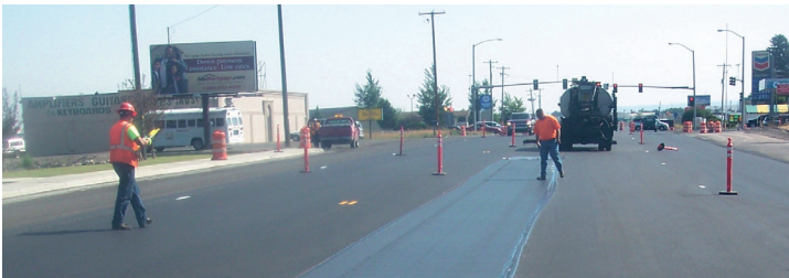
The higher strength at low strain of GlasPave Paving Mats extends pavement life by delaying reflective cracking.

The high performance hybrid fiberglass structure of the GlasPave® Paving Mats provides significantly greater tensile strength at low strain compared to conventional paving fabrics and other paving mats. The higher strength at low strain helps extend pavement life by delaying reflective cracking, which is a common contributor to costly repairs and the eventual failure of asphalt overlay applications.