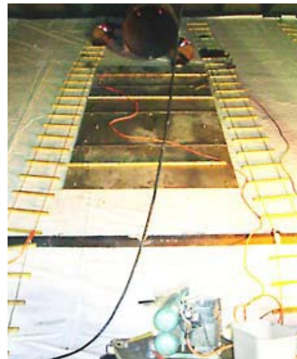
Figure 11. Stainless steel splash plate during installation.