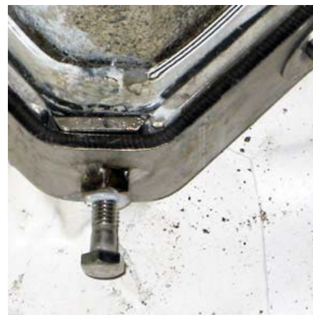
Figure 7. Special corner clamp to maintain pressure at the point of the concrete footing.

Layfield followed the guidelines of ASTM D6497 for pipe boots and attachments. For attachments on this project, 6 mm x 50 mm (¼" x 2") 316 stainless steel batten bars and 9.5 mm (3/8") 316 stainless steel anchor bolts on 150 mm (6") centers were used. The four slope columns used the same batten system modified to accommodate the slope. The pipe boots followed the standard industry attachment guidelines but were