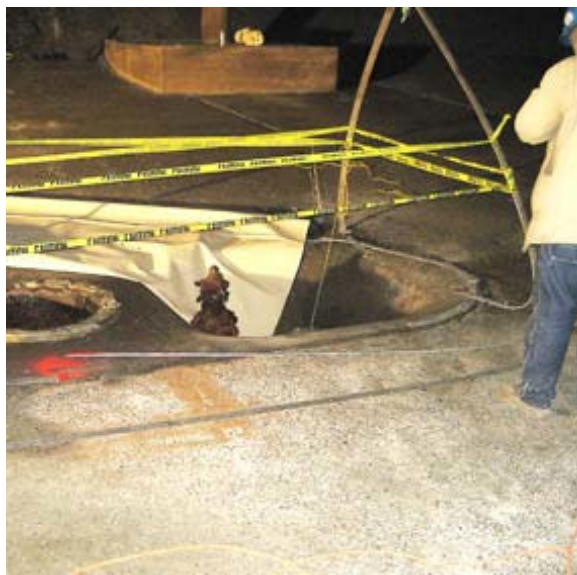
Figure 4. Surge tube leading into a small bypass outlet that connects to the main drain (circular opening on the left)