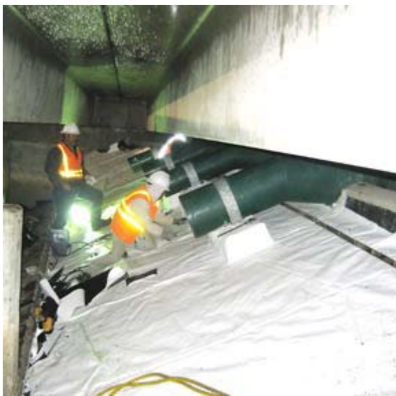
Figure 10. Sealing the liner under multiple small inlet pipes.

challenged by tight space constraints, concrete remedial work, and dewatering requirements. To address the problem of sealing around concrete corners, Layfield designed and fabricated special compression corner clamps (Figure 7). The complicated penetrations and attachments in this project required a lot of time and detail.