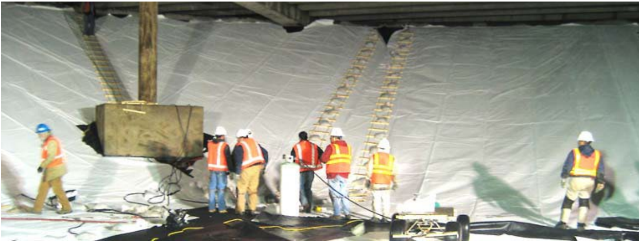
Figure 6. Workers in reservoir showing PPE, hand cart for moving heavy objects, and rope ladders for slope safety.

This site required a custom designed safety program. This document included site specific requirements to deal with surge water, emergency egress, power failure procedures, and air safety. High output fans were required at the new equipment hatch to create sufficient air turn over to protect workers in the reservoir. This was backed up with air quality monitoring devices within the confined area. An evacuation procedure was developed in the event of a power failure. All personnel on site were trained on this procedure.