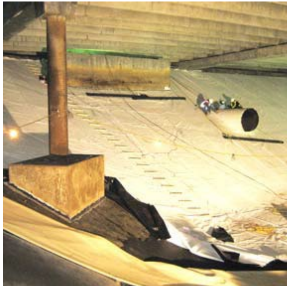
Figure 5. Surge tube (beige tube in foreground) directing surge water to the primary drain. Note the 1.2m (48") pipe boot and sloped column support in the background

To address this concern, Layfield fabricated and supplied a 2 m (6.6') layflat bypass tube from reinforced Polypropylene. This tube was attached to the 1.2 m (48") surge in-flow pipe and extended into the primary drain in the bottom of the reservoir. This allowed incoming surge water to be directed to the drain inlet during construction. As a further back up, Layfield had on site two portable coffer dams (Aqua Dams®) that could be filled with water to dam off a section of the reservoir if the surge water tube unexpectedly didn't work. A plan was in place to inflate the two water-filled coffer dams in the event of an emergency using water from an available hydrant. This back-up plan would then allow time to retrieve equipment and to try and shut off the surge water. During the construction of this project we experienced about two to three surges per day, from a small trickle, to significant water flows. The bypass tube worked as designed and was removed after the final liner tie-in at the completion of the project.