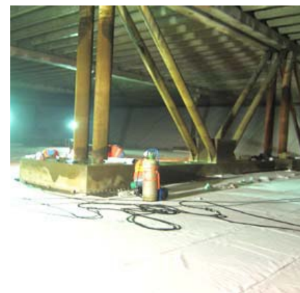
Figure 8. Attaching the geomembrane to the large seismic beam in the center of the reservoir.