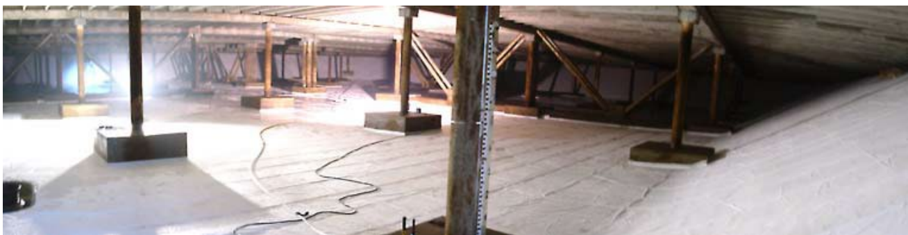
Figure 16. View of the south side of the completed reservoir.

was not leaking. No leakage was found within the reservoir as determined by a static test and no additional water was found in the under drain system. There was also no chlorine residual detected in the groundwater or under drain system. This project included a large number of difficult challenges that added complexities and time constraints to an already difficult geomembrane installation. It was further impacted by a number of unforeseen external factors related to water infiltration and poor weather conditions. The City of Everett Number 3 Reservoir lining project was completed two days ahead of schedule and met all performance and water test requirements. It is our view that this difficult project was a success due to a number of factors including the quality of the project design provided by the engineer; excellent communications and cooperation between the contractor, owner and engineer; and the project management experience of our installation staff. Without the teamwork of the City of Everett, the design engineers and its sub-consultants in conjunction with the Layfield team, this highly difficult project would not have been completed on time or on budget and certainly would not have included the many system upgrades provided. All parties involved concluded this highly challenging project was well managed and successful.