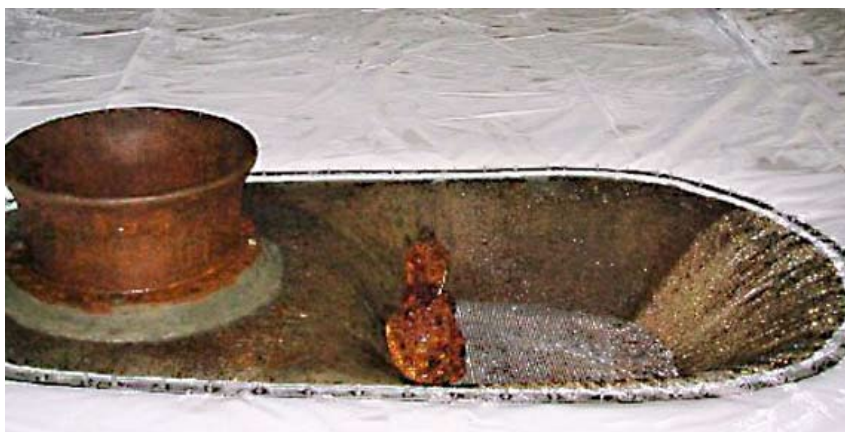
Figure 14. The primary drain after liner installation and disinfection. The bell standpipe is for normal drainage and is designed to exclude silt. The dished section on the right is a small bypass for draining of the reservoir completely.

The disinfection method requires that a 50 ppm sodium hypochlorite solution be applied to the reservoir during initial fill. After working with the City on flow calculations and water quantities it was decided to bring in several 55 gallon drums of 12% sodium hypochlorite. The drums were placed at the new equipment hatch and a chemical feed pump was used to pump the sodium hypochlorite solution into a plastic hose that was placed directly in front of the inlet pipe to allow the mixing of the sodium hypochlorite with the inlet water as it cascaded down the splash pad.