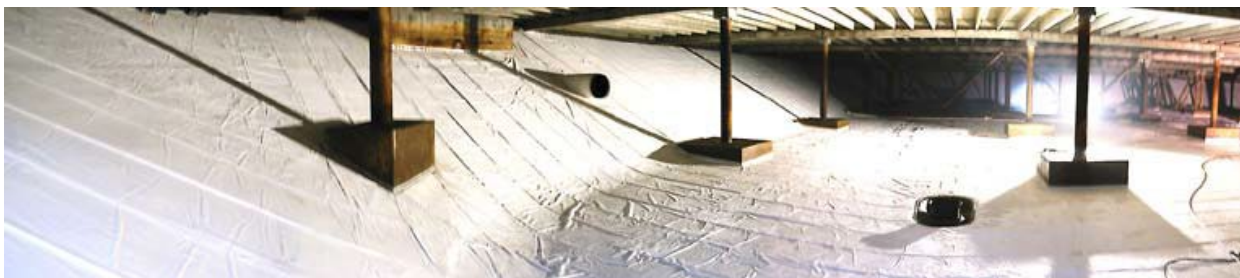
Figure 15. Panorama of north side of completed reservoir.

Recognizing the importance of meeting the timeline for the City of Everett and the project risk, Layfield ensured this project received a high priority in terms of planning and project management. Even with frequent water intrusions interruptions and the additional time required to remove and replace concrete, the project was completed ahead of schedule. In fact, Layfield was able to apply for bonus money of $5,000 per day for early completion of the work.