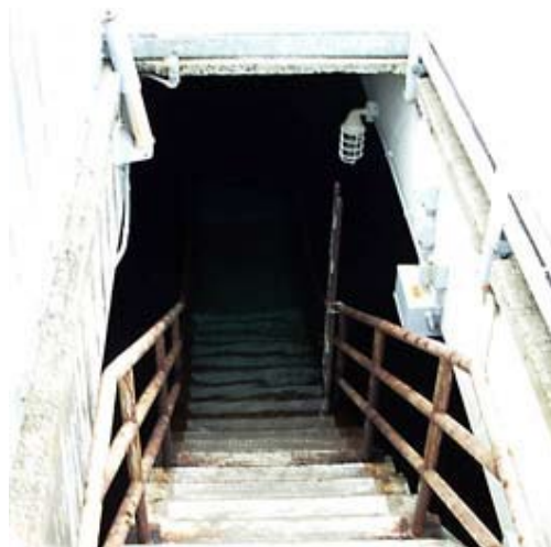
Figure 2. Main hatch showing restricted entrance

To address this issue Layfield commissioned the design and construction of a new equipment hatch that was placed on the opposite side of the reservoir and located over the toe of slope. By locating a hatch over the toe of the slope the materials could be lowered directly to the base of the reservoir. This allowed the heavy materials to be moved in and out of the reservoir with a crane. The new hatch was located so that City water operators had a direct view of the main inlet pipe. This would let them