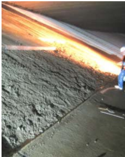
Figure 12. Once the concrete was removed an engineer determined how much of the saturated subgrade to remove.