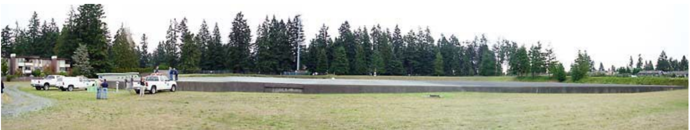
Figure 1. Above Ground view of the City of Everett Number 3 Reservoir

Various project criteria were reviewed regarding the selection of the geomembrane. The first requirement of the geomembrane was the need to be NSF 61 listed for use in potable water containments. The geomembrane also needed to have adequate long-term resistance to chlorine used as a disinfectant. This included resistance to chlorine levels as high as 50 ppm used for disinfecting the geomembrane prior to commissioning of the system (ANSI/AWWA C652 Method #3). The consulting engineering firm was especially concerned with choosing a geomembrane that would not crack when exposed to chlorinated water in long-term service. The geomembrane needed to have the flexibility to be mechanically anchored to inlets, outlet and overflow pipes, a multitude of concrete column footings, 4 unique slope columns and a 100 m (330' lineal foot) seismic beam. Water was going to be present almost constantly during construction so the geomembrane needed to be prefabricated to speed installation and easily welded using various welding and gluing techniques. Finally, the geomembrane needed to be highly flexible, strong in tensile and sufficiently durable to withstand the construction and maintenance. The engineer produced a matrix of desired properties and matched them with various geomembranes available (Cooke, et al.) and concluded that a 45 mil Hypalon® (CSPE) white/black was the right material for this project.